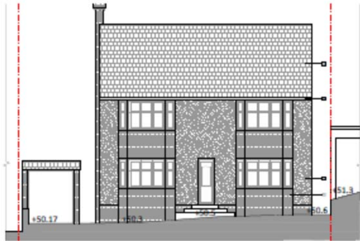
Figure 4: 22/04265/GPDO approval

8.11 There is also a fallback position in the form of the approved prior approval 22/04265/GPDO. This was for an upward extension to the existing property and the image to the right show what was consented and can be built out. This is a material consideration that further evidences the suitability of the increase in height to the bungalow as proposed in this application.