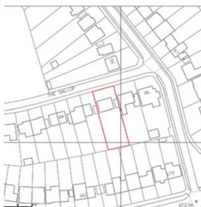
Figure 2: Location Plan