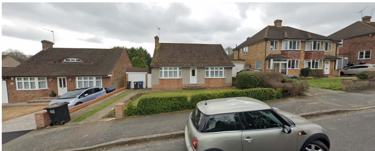
Figure 3: Street photo with 46 The Gallop located centrally

8.9 To the east, is 48 The Gallop which is a bungalow with rear extensions and set at a lower level than the application site. To the west is 44 The Gallop which is a two storey semi-detached property set at a higher level than the application site.